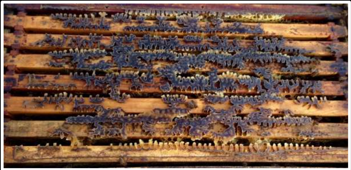
2016 Club photographic competition entry.

Next Meeting: Thursday 15 th December 2016