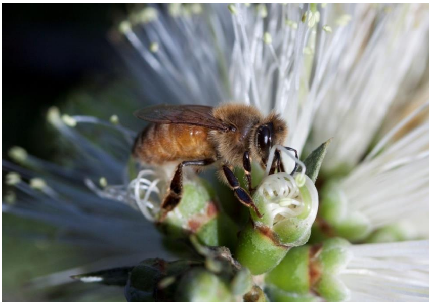
2nd prize 2016 competition.

To enhance the learning and better practices of the art of beekeeping within our community.